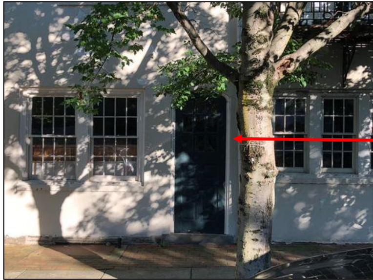
Location of New Apartment Entry Door at 14 W. Abington Ave