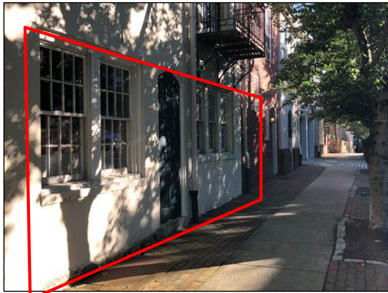
New Apartment windows and door along Abington Ave facade.